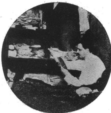
Fumando cigarrillos de opio, según los preceptos de Tomás de Quincey